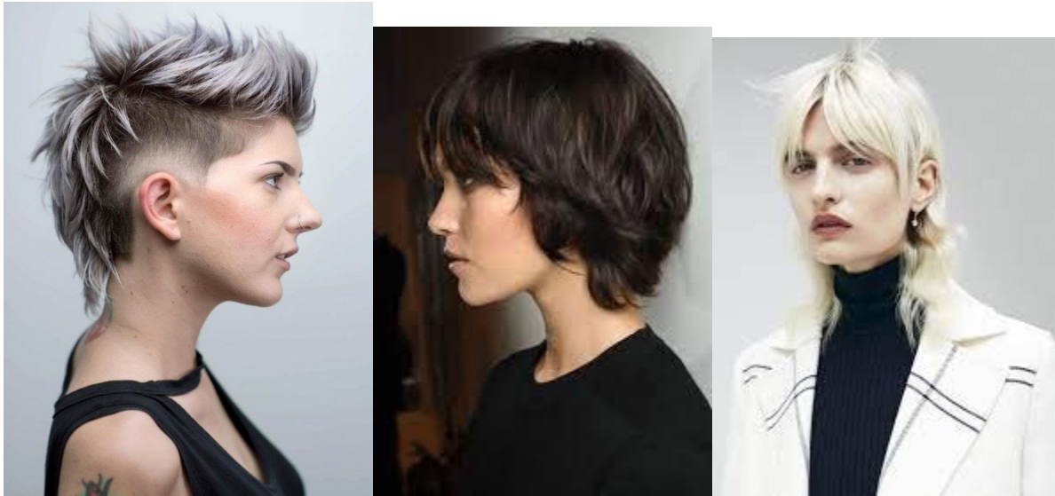
Color inspiration – On the day of the competition one of these choices will be revealed