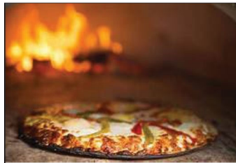
pizza in oven-1