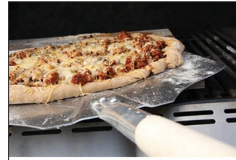
pizza on paddle-2