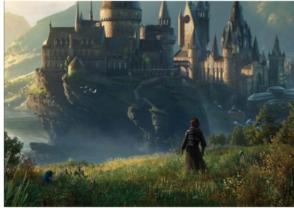
Reaching towards photorealism within the confines of game optimizations