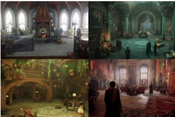
Textures clearly are linked to the houses of Hogwarts. Pay close attention to value and contrast.