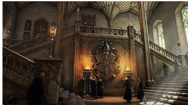
Medieval architecture is consistent throughout the game. Curves are intersecting straight lines, but features are very clearly defined and detailed.